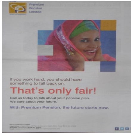
Figure 2: PPL ad